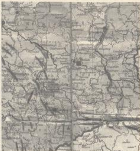
Map of Europe given to me by Russian tank driver.

On the sixth day, about 15 miles from Magdeburg on the Elbe River, we ran into a 40 man patrol of German soldiers. Much to our surprise they did not fire on us, and an Officer came forward with a white flag. He spoke broken English and indicated he wanted to surrender to us and be taken prisoner by Americans rather than by Russians. We told him that we could not take his patrol with us but if he wanted to come, he was welcome. We told the Germans to lay down their weapons and head west with a white flag to the American lines.