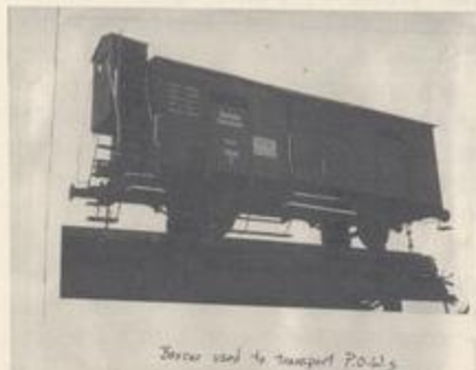
Boxcar used to transport POWs

This was my home for the next seven days. We were not given any food or water the first 3 or 4 days and were not allowed out even for hygiene purposes. The night of Dec 24 th we were parked in the marshaling yards of Limburg, Germany when the RAF made a bombing attack. They had no way of knowing that we