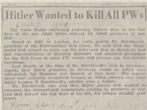
Army Stars & Stripes newspaper article found after liberation..

On or about April 1, 1945, we were called out for a special roll call. We noticed extra guards were in the towers with additional machine guns. The German Commander ordered all Jewish prisoners to step forward. Immediately whispers went through the ranks that no one was to step out. After a few moments, the command was repeated again and with a lot of gesturing and hollering. Then the word went through the ranks that everyone should step