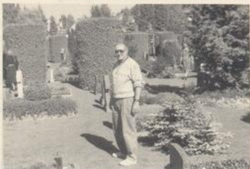
Standing in the graveyard I had slept in the night before being loaded into boxcars. Gerolstein, Germany Oct '96

We discovered the actual areas that I had been. Even more thrilling in the midst of the dense forests of the Ardennes were the foxholes. Some have never been disturbed in over 55 years. We retrieved rusty mess kits, lantern, and ammunition clips for both rifles and machine guns.