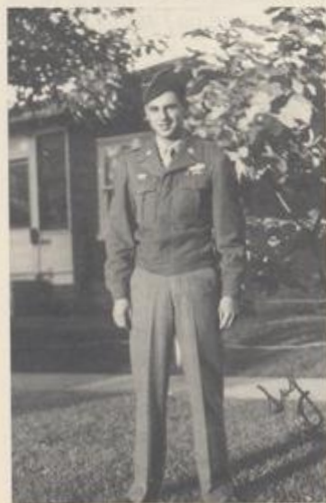
First visit home after return to States. June 1945