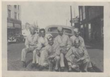
Airborne buddies on weekend pass Deadwood, SD - September 1943

We took 25 mile hikes, with full field packs as though they were a stroll through the park and then went into town afterwards to party. We had a mountain called Bear Butte which was about 3500 feet high and Units competed to see how fast each could climb it with full field packs and rifles and return with the least amount of men falling out. I was quite proud that I never once fell out of formation.