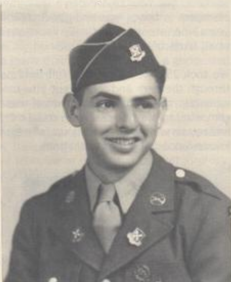
June 1943 - 88 th Airborne Infantry

We were ordered to Ft Meade, South Dakota to join the 88 th Airborne Battalion. We had no idea that this outfit had been formed in October 1942 as an experimental organization. Its assignment was to introduce all aspects of airborne warfare to America's military forces. In other words: Special Forces, a term that had yet to be invented.