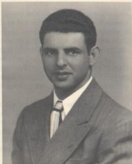
High school portrait - fall 1942