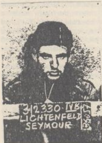
German POW ID photo - Dec. 1944

University. I thought that after giving my name, rank, and serial number I would be through (per stateside training). Was I ever wrong. He not only told me what outfit I was with, where we had shipped from, what ship we came over on, and where we trained in England. I was flabbergasted. When he wanted to see my dog tags, I indicated that I had lost them. (Much later after liberation by the Russians, I got a hold of my prison record and I found "Jew" marked on the face of it. So much for destroying my dog tags.)