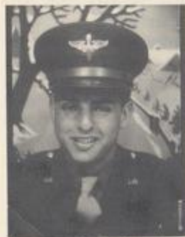
Aviation cadet Knox College Jan. 1944

After a few months of additional training, I saw a notice on the orderly room bulletin board that an examination would be offered to all enlisted men who would care to join the Aviation Cadet program to become a pilot. I wasted no time and my name was at the top of the sign up list. In December 1943, I was notified that I was one of two enlisted personnel that had passed the examination on that post and would shortly receive my new orders to proceed to Jefferson Barracks, Missouri for reassignment to the Air Corp. I couldn't believe my good fortune. My buddies threw me one hell of a party prior to my leaving. I was later to learn that my squad was in a glider that was shot down on D-Day with no survivors.