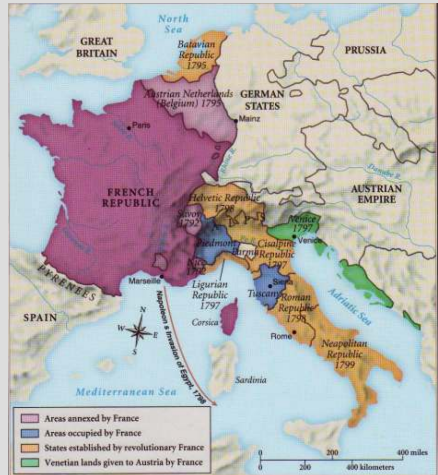
MAP 20.3 French Expansion, 1791-1799