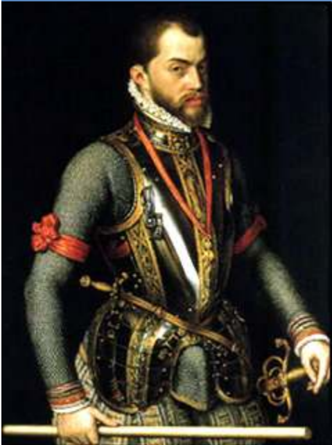
Philip II of Spain (r. 1556-1598)

Father – Charles V – Holy Roman Emperor Mother - Isabella of Portugal