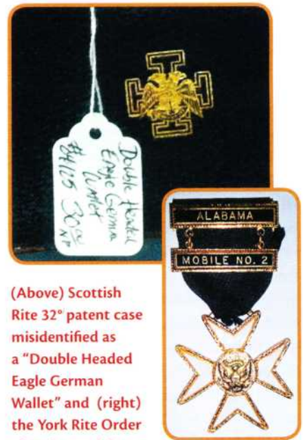
(Above) Scottish Rite 32° patent case misidentified as a "Double Headed Eagle German Wallet" and (right) the York Rite Order of Malta medal often is confused with a GAR funeral badge.

screen. Based on the archive file information, it was described as the one and only such visit made by Teddy Roosevelt in this southern port city. This meant the photograph was taken in front of Mobile's U.S. Customs House. However, I recognized the image as the 1902 cornerstone ceremony of the Masonic temple constructed by the three downtown lodges and the area York Rite bodies. The two buildings were on the same block but face different streets and the two events were separated by three and a half years. When I mentioned this confusion about the temple to the museum's curator of history and the archive's director, they spoke with confidence that the photograph definitely marked the first