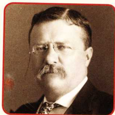
Bro. Theodore Roosevelt 26th US President, 1901-1909